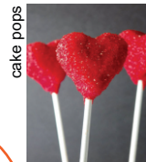
sweets by: the cake popper