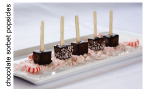
sweets by: elite productions intl.