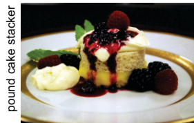
sweets by: katherine king special events & catering