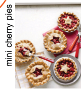
sweets by: country living