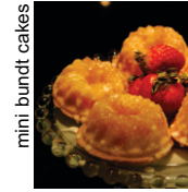
sweets by: katherine king special events & catering